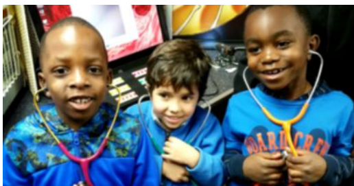
The Trailblazer... makes hearts beat a little faster

Step on board and see where the Trailblazer takes you!