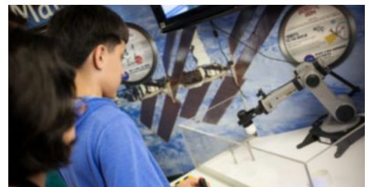
The Trailblazer... lands the space station in your parking lot