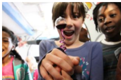
The Trailblazer... gets kids bug-eyed